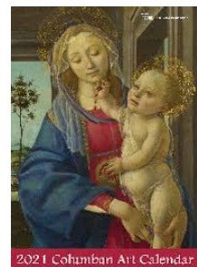
2021 Columban Art Calendar